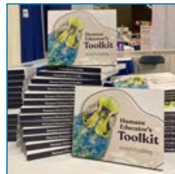
600 Toolkits were handed out at teachers' conventions this winter

A survey of Alberta teachers conducted in 2020 revealed that teachers see themselves playing an essential role in teaching young people about animal welfare. However, they identified certain barriers to including animal welfare education in the classroom, such as a lack of resources and professional development. In response to the results of the survey the education department created a Humane Educator's Toolkit. This toolkit aims to provide teachers with information and resources to bolster empathy and respect for all living things in the classroom, explain its importance, and remain in alignment with curricular outcomes.