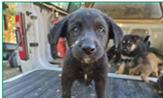
Puppy rescued from a northern community

Alberta SPCA Peace Officers and staff worked hard to help animals impacted by wildfires in Alberta this spring. Team members operated in Drayton Valley and Brazeau County, at the request of the municipalities, feeding animals in their homes; pets that were not able to evacuate with their families. Teams of Peace Officers, staff members, and locksmiths entered homes with the permission of the animal owners to check on the welfare of the pets and ensure they had food and water to last several days. Peace Officers also helped escort residents into the communities to pick up and remove their pets from the evacuation zone.