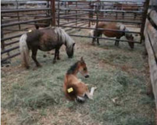
Horses at Alberta SPCA Rehoming Sale