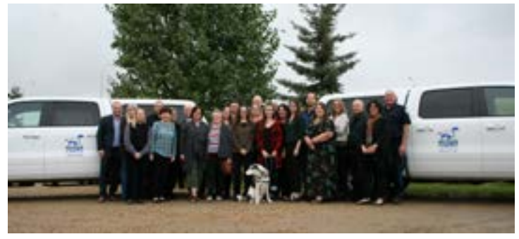
Alberta SPCA Staff & Board - Sept 10, 2019 ...continued on p. 6